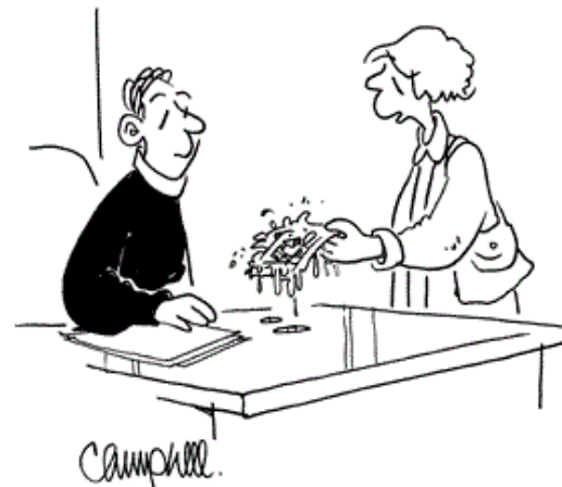
"The dog ate our pledge card, but the veterinarian made him spit it out."